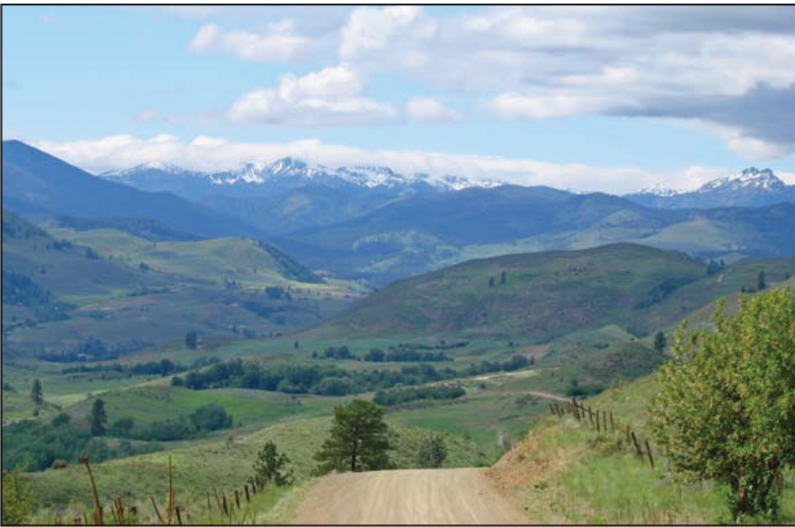
The view from Upper Bear Creek Rd across the landscape of Pearygin Lake State Park and the hills of Winthrop show a summer growing up lush and green. Snow from the mountains will water the creeks and rivers, helping farmers and fish, for many months to come.

June 21 st : “The Owl & the Woodpecker” Methow Conservancy “1st Tuesday” at the Burke Museum in Seattle with Paul Bannick. See the article on pg 3.