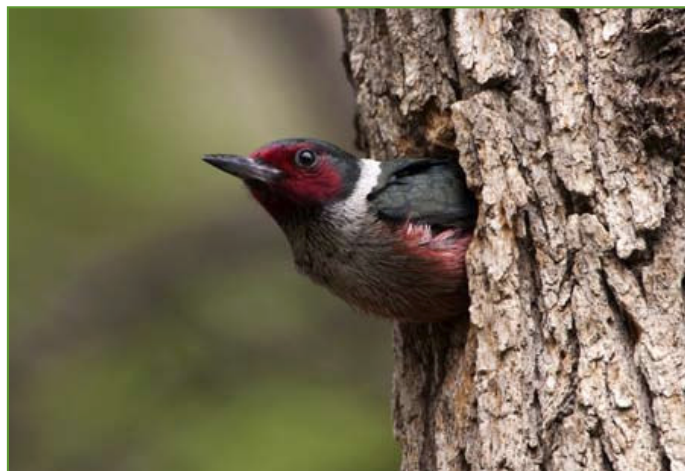
Lewis' Woodpecker