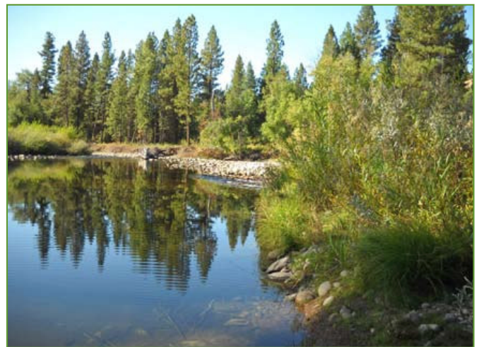
The numerous side channels and pools, and the intact nature of the Chewuch River watershed combine to create a productive drainage that has made the Chewuch River a conservation priority for endangered spring chinook salmon, steelhead trout, and bull trout.